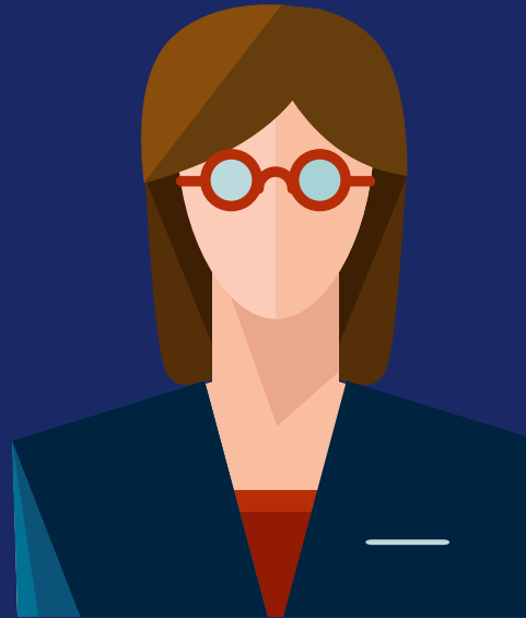
Female Unemployment Rate (Pre-pandemic vs. post-pandemic)

women's earnings as a percent of men's earnings in NYS in 2022 (full-time year-round workers)